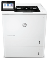
HP LaserJet Managed E60065x