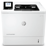
HP LaserJet Managed E60065dn

This HP LaserJet Printer with JetIntelligence combines exceptional performance and energy efficiency with professional-quality documents right when you need them—all while protecting your network from attacks with the industry's deepest security. 1